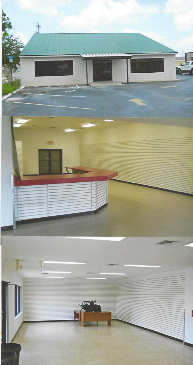
939 Country Club Building